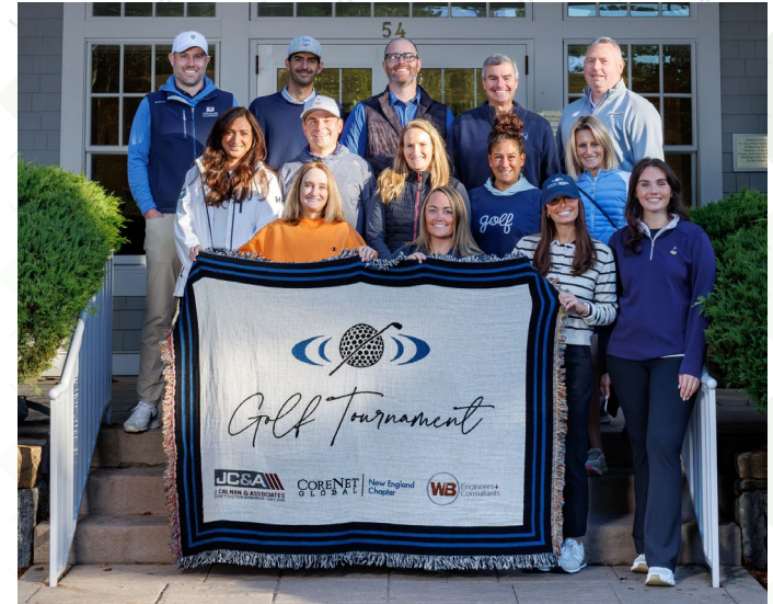
Photo of 2025 gift - 2026 gift will vary