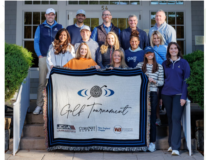
Photo of 2025 gift - 2026 gift will vary