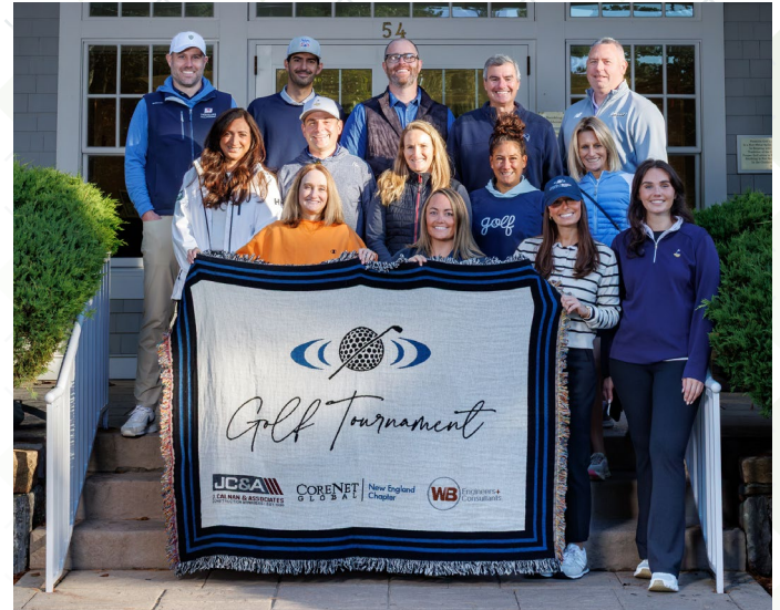
Photo of 2025 gift - 2026 gift will vary