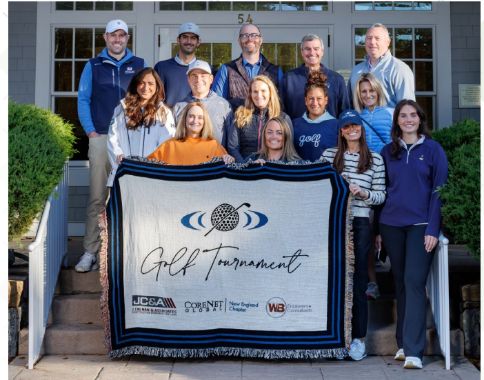
Photo of 2025 gift - 2026 gift will vary